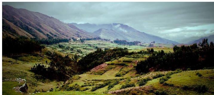
Dhruv Duggal The Peruvian Countryside