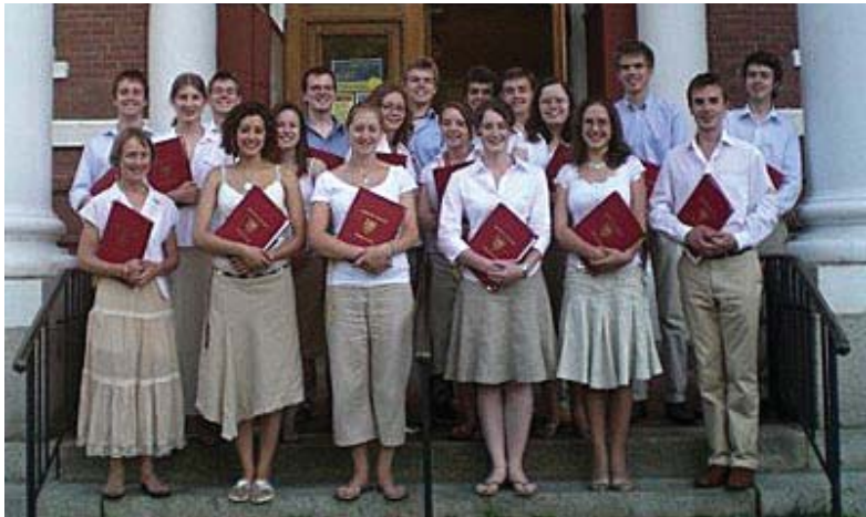
Downing College Chapel Choir.