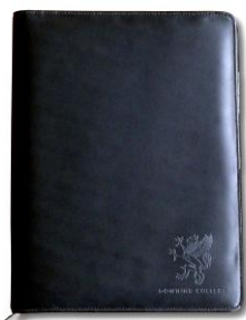
Genuine leather portfolio

These use the same stylised sterling silver Griffin as the pendant, quality-crafted into uniquely distinctive cufflinks with bayonet fixing.