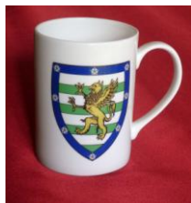
Bone china beaker

A limited edition (850) signed print. Available in a light oak stained wooden frame or on card. Frame size approx. 325 x 290 mm.