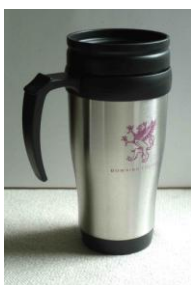
Lightweight insulated tumbler