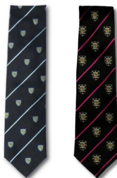
Bicentenary tie (silk)