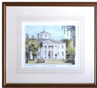
Print of an earlier watercolour of the College Library by Cambridge artist Philip Martin

A limited edition (850) signed print. Available in a light oak stained wooden frame or on card. Frame size approx. 325 x 290 mm.