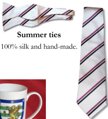
Summer ties 100% silk and hand-made.